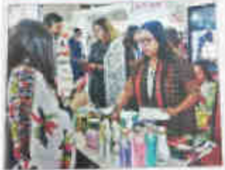
আইসিপিবিতে গৃহদামগ্রী প্রদর্শনী