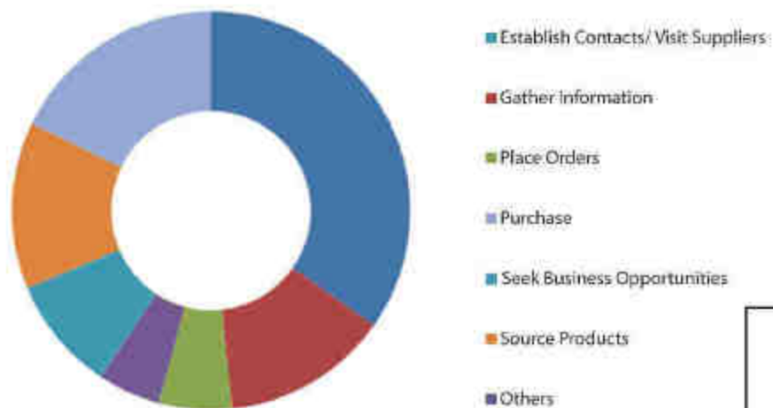
PURPOSE OF THE VISITOR- HEALTH & FITNESS 2019