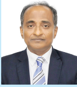
Mahbubur Rahman Secretary Ministry of Commerce Government of the People's Republic of Bangladesh